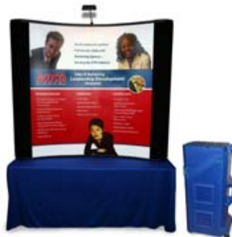
With center graphics