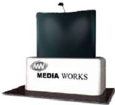
With fabric panels