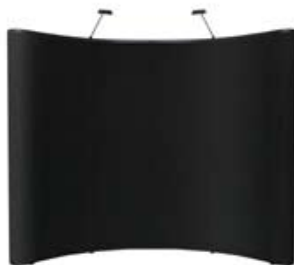
Fabric panels only