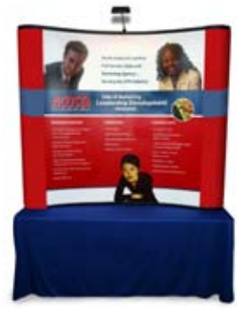
With full wrapping graphic