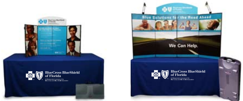
ShowStyle® 4' x 2' display area 23.75" x 7.5" header