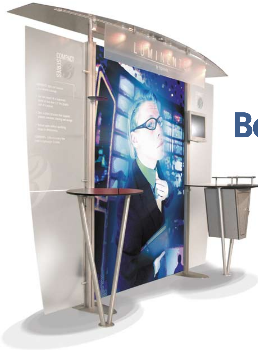
Exhibit Design | Large Format Printing & Finishing | Sales and Rentals

Get noticed with a dynamic exhibit from Media Works. Let us create an exhibit that incorporates your goals and captures your audience.