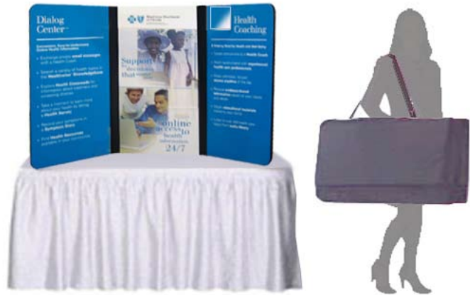
Table cover and table not included

Options: Additional heights, top shapes, headers, lights and shipping cases